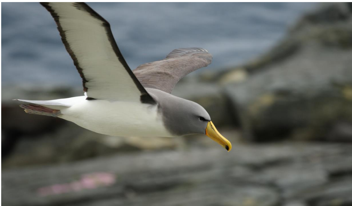
Chatham Islands albatross.