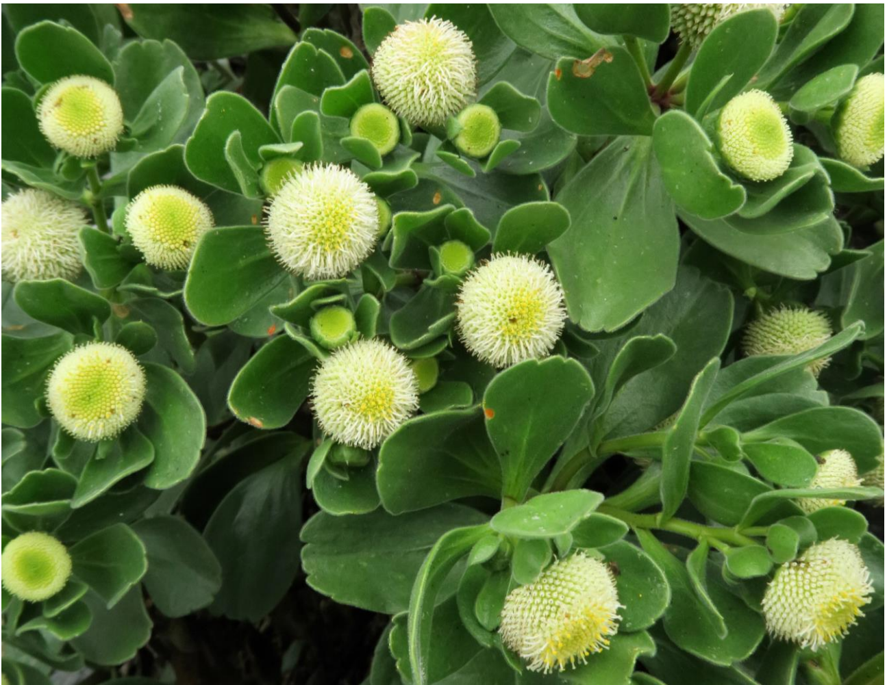
Chatham Islands button daisy.

A progress review will take place biannually. This will be followed by a review of the Strategy and the development of a 5-yearly implementation plan.