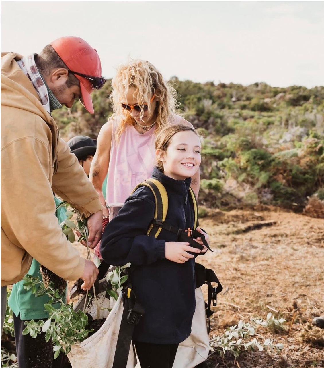
Restoration planting.

A land apart for people, plants and birds: restoring nature's gifts.